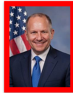
Lloyd Smucker, Ranking Member

Joe Courtney Mark Takano Pramila Jayapal Josh Harder Andy Levin Ilhan Omar David J. Trone Susie Lee Lori Trahan Joaquin Castro Raúl M. Grijalva Gregorio Kilili Camacho Sablan Suzanne Bonamici Alma S. Adams Donald Norcross