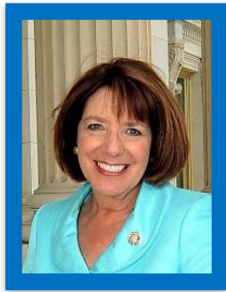
Susan A. Davis, Chair

Education and workforce development beyond the high school level, including but not limited to higher education generally, postsecondary student assistance and employment services, and the Higher Education Act , including campus safety and climate; adult education; postsecondary career and technical education, apprenticeship programs, and workforce development, including but not limited to the Workforce Innovation and Opportunity Act , vocational rehabilitation, and workforce development programs from immigration fees; programs related to the arts and humanities, museum and library services, and arts and artifacts indemnity; science and technology programs; and domestic volunteer programs and national service programs, including the Corporation for National and Community Service.