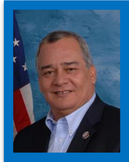
Gregorio Kilili Camacho Sablan, Chair

Education from early learning through the high school level, including but not limited to early care and education programs such as the Head Start Act and the Child Care and Development Block Grant Act , special education, and homeless and migrant education; overseas dependent schools; career and technical education; school climate and safety, including alcohol and drug abuse prevention; educational equity, including facilities; educational research and improvement, including the Institute of Education Sciences; and pre-service and in-service teacher professional development, including Title II of the Elementary and Secondary Education Act and Title II of the Higher Education Act .