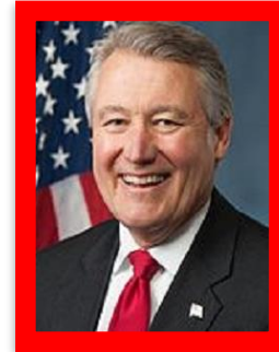
Rick W. Allen, Ranking Member

Kim Schrier Jahana Hayes Donna E. Shalala Susan A. Davis Frederica S. Wilson Mark DeSaulnier Joseph D. Morelle