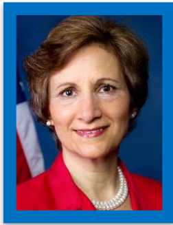
Suzanne Bonamici, Chair

Matters relating to equal employment opportunities and civil rights generally; welfare reform programs, including but not limited to work incentive programs and welfare-to-work requirements; poverty and human services programs, including but not limited to the Community Services Block Grant Act and the Low Income Home Energy Assistance Program ; the Native American Programs Act ; school lunch and child nutrition programs; matters dealing with programs and services for the elderly, including but not limited to nutrition programs and the Older Americans Act ; adolescent development programs, including but not limited to those providing for the care and treatment of certain at-risk youth such as the Juvenile Justice and Delinquency Prevention Act and the Runaway and Homeless Youth Act ; and matters dealing with child abuse and domestic violence, including but not limited to the Child Abuse Prevention and Treatment Act and child adoption.