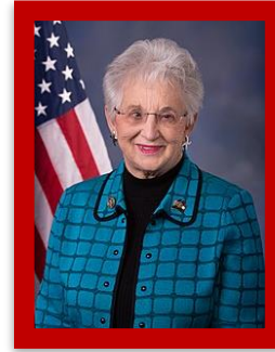
Virginia Foxx (NC-05), Ranking Member