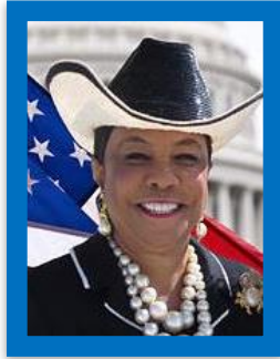
Frederica S. Wilson, Chair

Matters dealing with relationships between employers and employees, including but not limited to the National Labor Relations Act , the Labor-Management Relations Act , and the Labor-Management Reporting and Disclosure Act ; the Bureau of Labor Statistics; and employment-related health and retirement security, including but not limited to pension, health, other employee benefits, and the Employee Retirement Income Security Act .