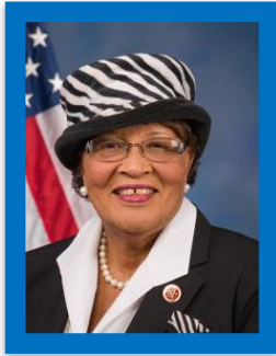
Alma S. Adams, Chair

Wages and hours of workers, including but not limited to the Davis-Bacon Act , the Walsh-Healey Act , the Service Contract Act , and the Fair Labor Standards Act ; workers' compensation, including but not limited to the Federal Employees' Compensation Act , the Longshore and Harbor Workers' Compensation Act , and the Black Lung Benefits Act ; the Migrant and Seasonal Agricultural Worker Protection Act ; the Family and Medical Leave Act ; the Worker Adjustment and Retraining Notification Act ; the Employee Polygraph Protection Act of 1988 ; trade, international labor rights, and immigration issues as they affect employers and workers; and workers' safety and health, including but not limited to occupational safety and health, mine safety and health, and migrant and agricultural worker safety and health.