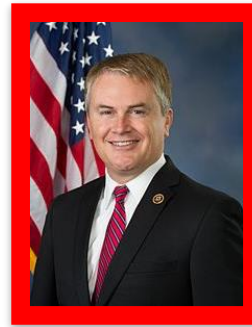
James Comer, Ranking Member

Raúl M. Grijalva Marcia L. Fudge Kim Schrier Jahana Hayes David J. Trone Susie Lee