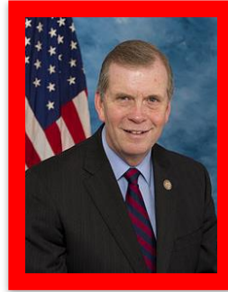
Tim Walberg, Ranking Member

Donald Norcross Joseph D. Morelle Susan Wild Lucy McBath Lauren Underwood Haley M. Stevens Joe Courtney Marcia L. Fudge Josh Harder Donna E. Shalala Andy Levin Lori Trahan (VACANT)